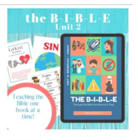
The BIBLE Unit 2: Nehemiah to Micah (13 Week Curriculum) from $97 $125