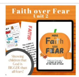
More FAITH Less FEAR: 4-Week Children's Ministry Curriculum (Unit 2 of Faith over Fear) $45