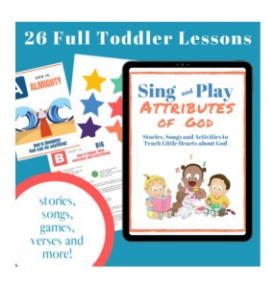
The Ultimate Toddler Bundle: Everything you need to teach age 1-3 about God